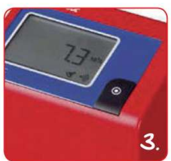
3. Read the value on the digital screen within 2 minutes